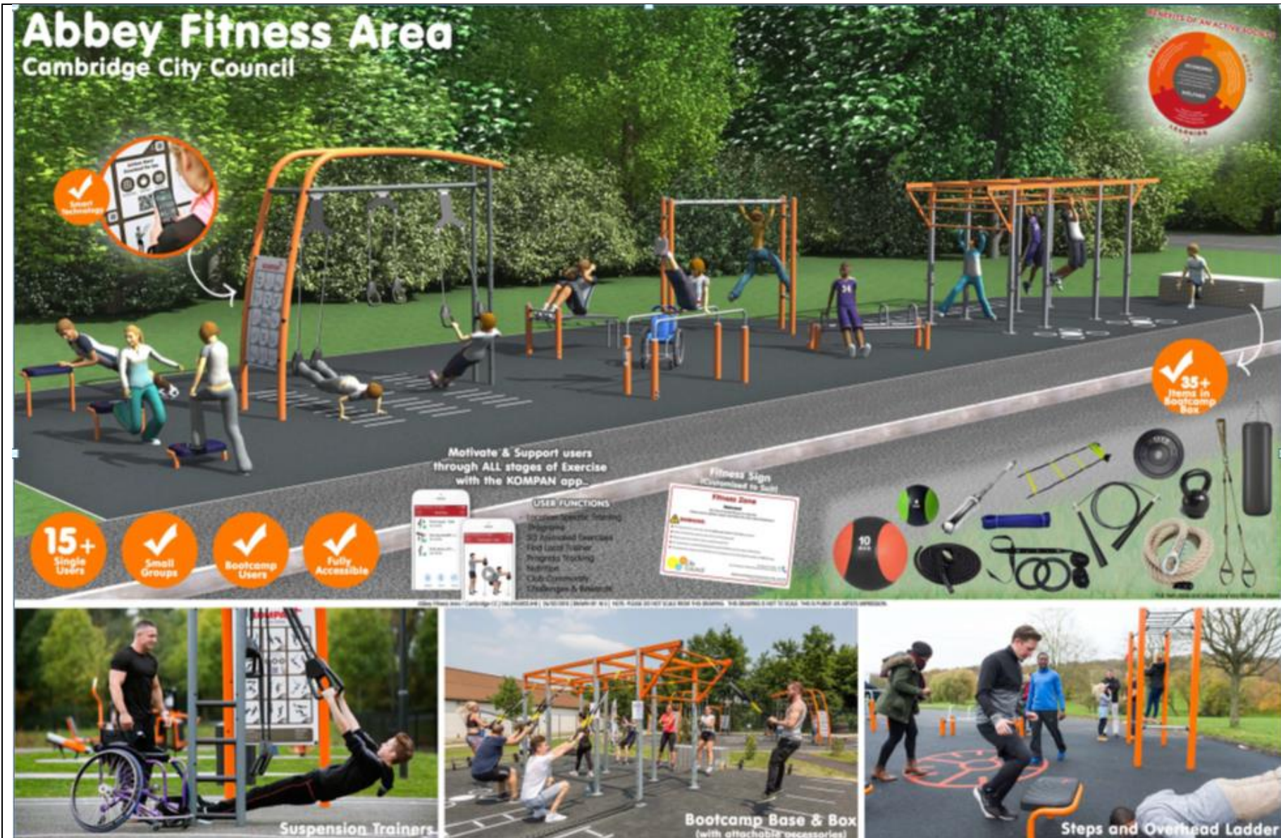
Abbey Pool – Fitness Equipment Layout and equipment to be installed